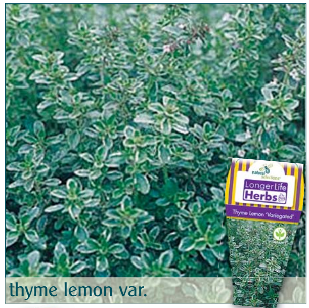
thyme lemon var.

( thymus citrodorus - Buntblattrig) - white-green foliage Medicinal plant, also ideally suited as a structural plant. Garden Height: 20cm, trailing habit up to 40cm.