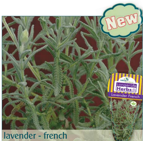
lavender - french

Evergreen, perennial shrub, strongly aromatic, silver foliage emitting a curry like smell, upright stems with brilliant yellow summer flowers.